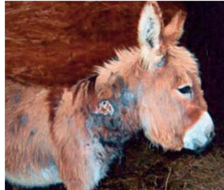
...burning holes with rope in the delicate skin around their necks...