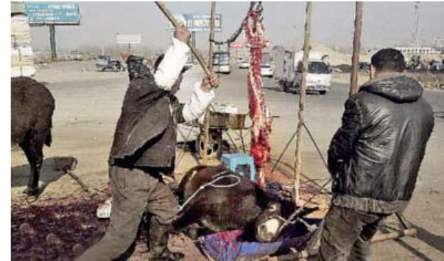
...and selling them to be slaughtered for their meat in...