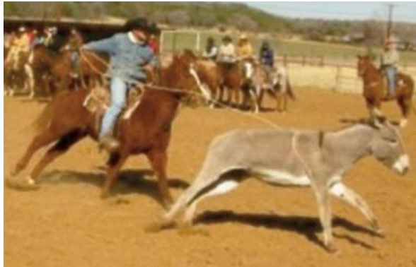
Having cowboys rope them head over heels until they break their bones or die from fear...